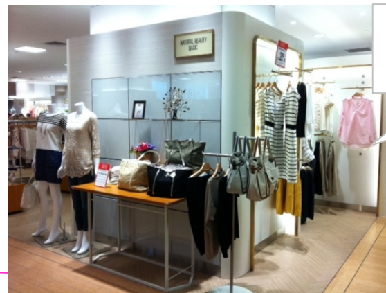
"NATURAL BEAUTY BASIC" Takashimaya Singapore