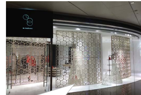
"m.tsubomi" China World Trade Center (Beijing) Branch