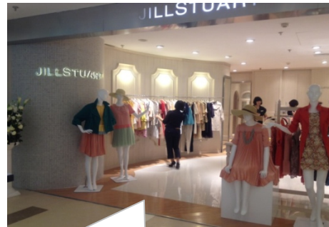
"JILLSTUART" Sunshine Department Store, Qingdao